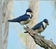
White Throated Swallow