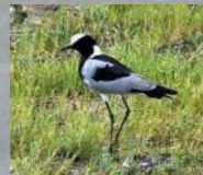
Blacksmith Plover /Lapwing