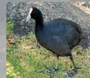
Red Knobbed Coot